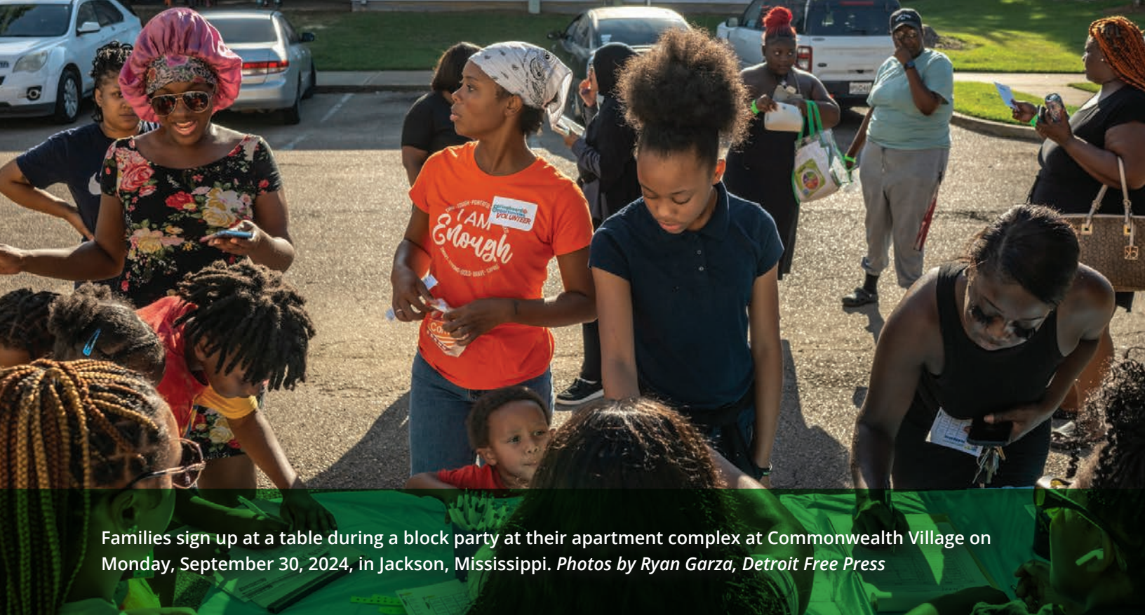
Families sign up at a table during a block party at their apartment complex at Commonwealth Village on Monday, September 30, 2024, in Jackson, Mississippi.